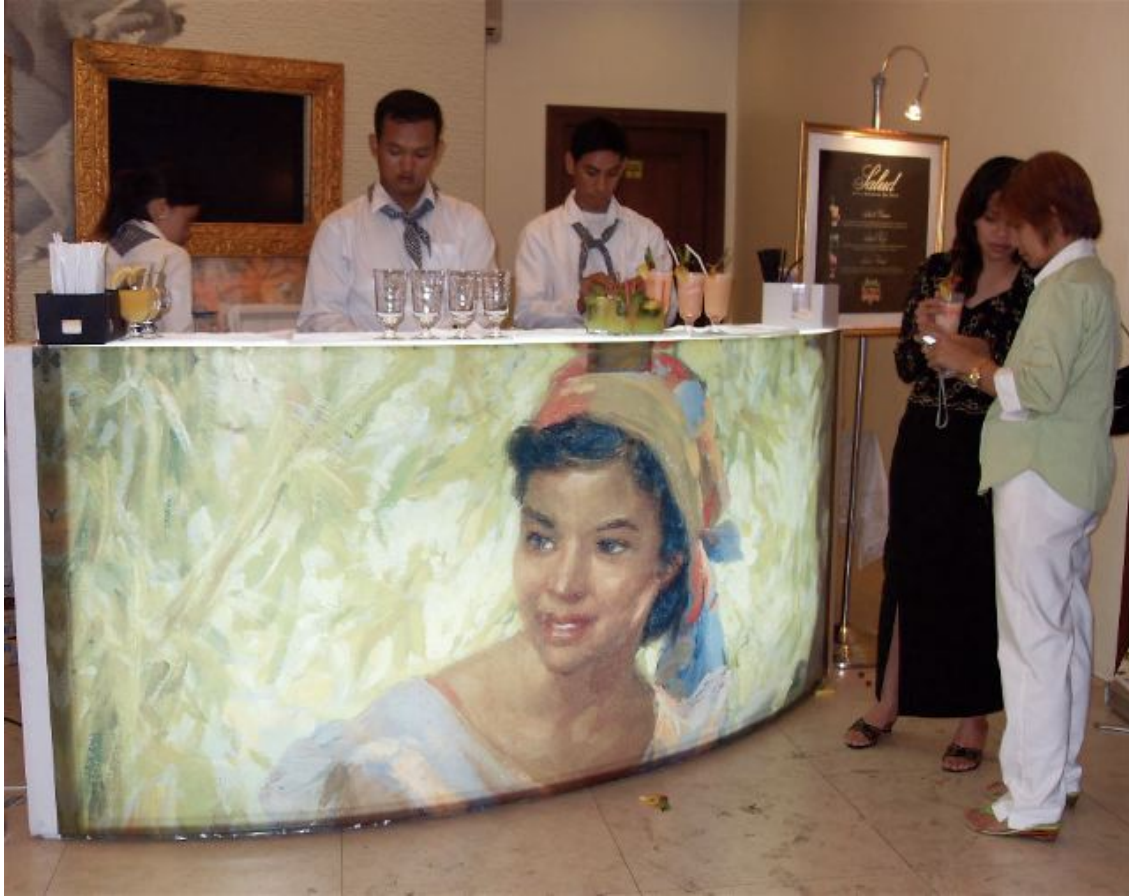
One of Amorsolo's paintings graces the front of the bar during the festivities.