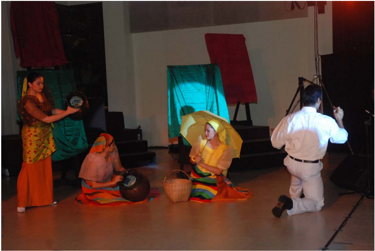
The acclaimed Bayanihan Dancers perform during the festivities. Dressed in attire that mimics Amorsolo's color palette, Bayanihan Dancers adds life to the night's event by interpreting traditional Amorsolo rural scenes during their dance routine