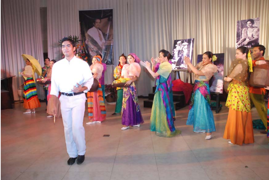
Dancer in white portrays Amorsolo as a young man embarking on his career.