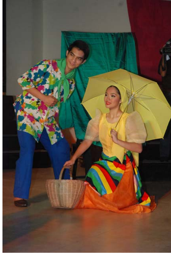
Bayanihan Dancers strike poses similar to the unveiled paintings.